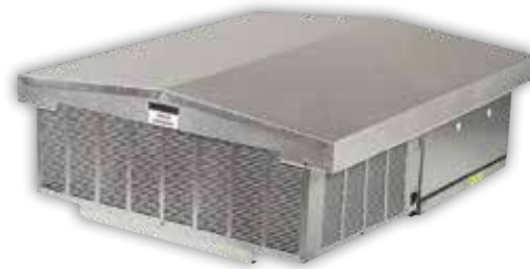
Outdoor ceiling mount Capsule Pak