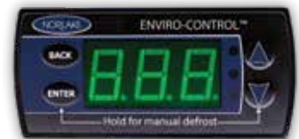
Enviro-Control included as standard on remote Capsule Pak models