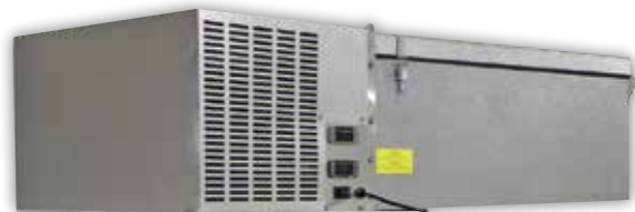
Indoor ceiling mount Capsule Pak