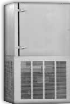
Indoor wall mount Capsule Pak