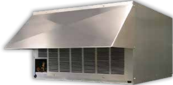
Outdoor Split-Pak condensing unit